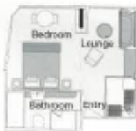
Emerald Riverview Suite