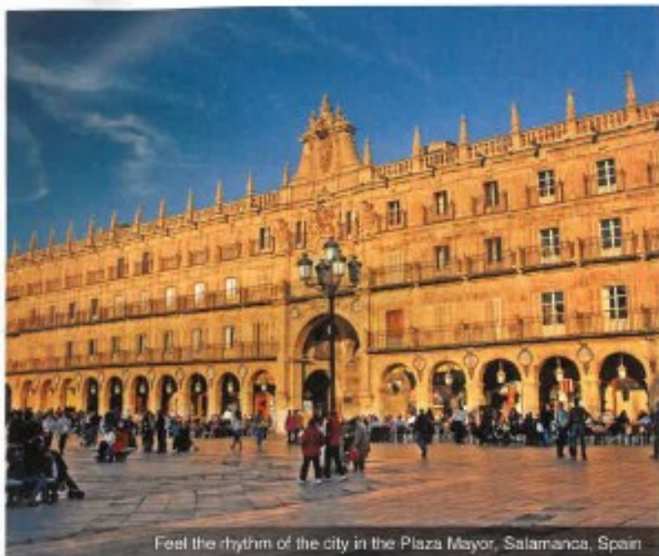
Feel the rhythm of the city in the Plaza Mayor, Salamanca, Spain

DAY 1 Depart the USA: Depart the USA on your overnight flight to Lisbon, Portugal.