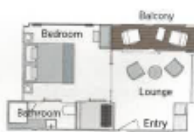
Owner's One-Bedroom Suite