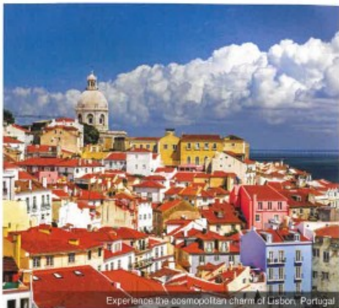
Experience the cosmopolitan charm of Lisbon, Portugal