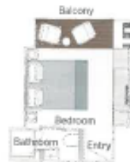
Panorama Balcony Suite